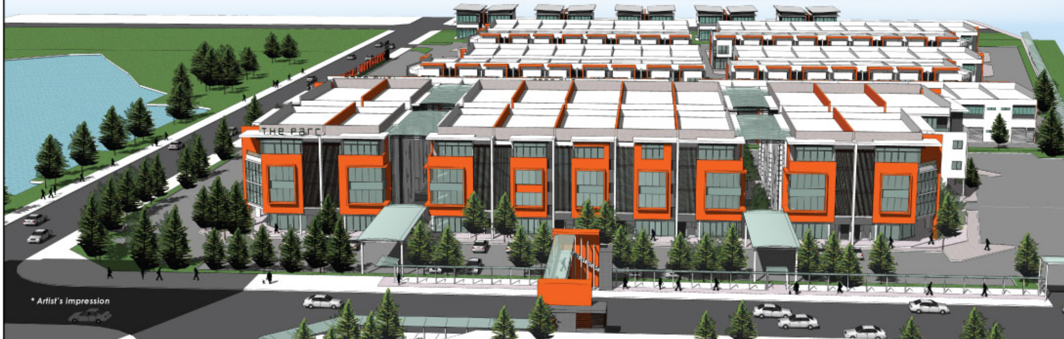
* Artist's Impression

IDEAL FOR Leisure • Bank • Stockist • Office • Shop • Restaurant • Clinic • College